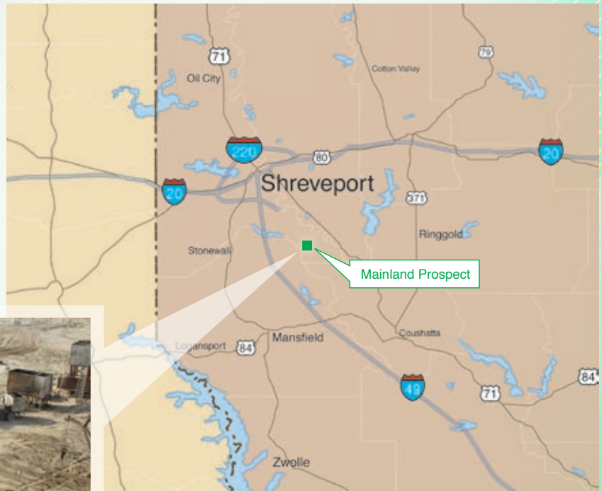
Mainland Resources, Inc. locator map - Shreveport Region